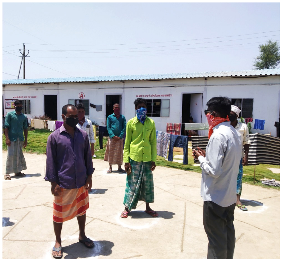
Social distancing training