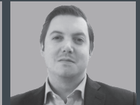
John Thompson Communications, London