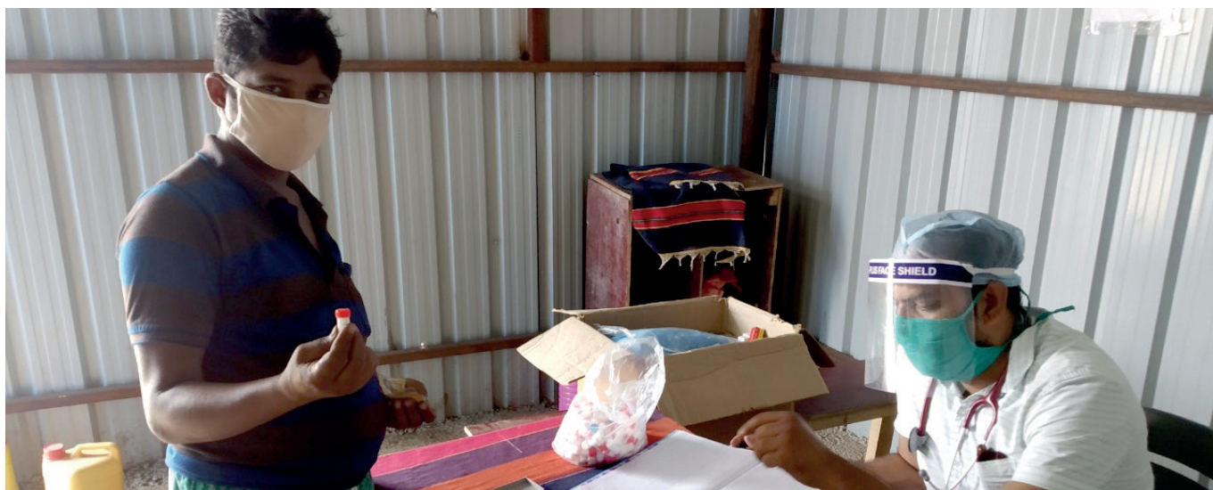
COVID-19 testing on site