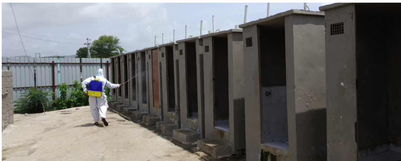
Keeping workers safe