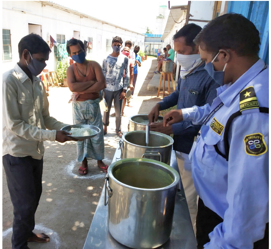
Food distribution on site

One needs a lot of grit and determination to tide over this phase and to stay focused and keep doing the right things. To achieve this, one should have proper value systems, high governance standards, a heart in the right place and a positive outlook towards life and livelihood. Needless to say, all the stakeholders of Joyville – Shapoorji Group, Actis, IFC & ADB are built on strong platforms and have imbibed Joyville with the right value constituents to help the management team move forward with more rigor and confidence.