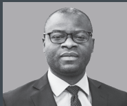
Hilaire Dongmo Real Estate, London