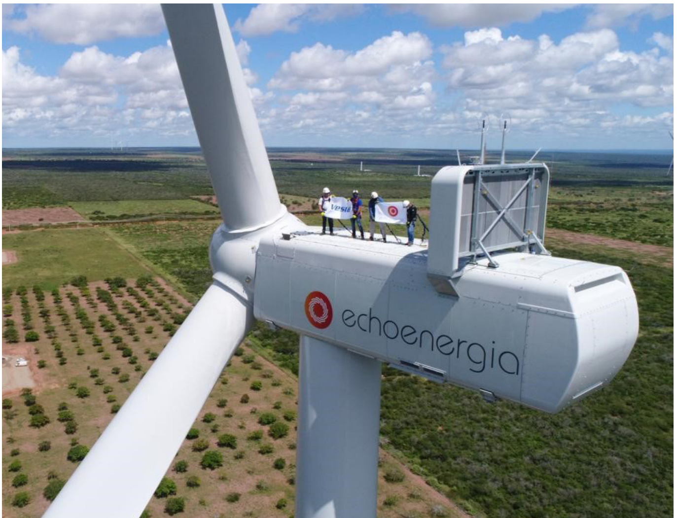
Echo Energia continuing to generate power for Brazilians throughout the crisis

The performance of any organisation through a crisis or serious event is a direct correlation of how well that business was being managed prior to the incident and we believe that the way in which Actis and its Energy Infrastructure platform companies have weathered and continue to weather this particular storm is a great example of this. It also demonstrates the robust nature of investing in best in class power generation assets that have robust contractual frameworks and are designed to weather even the most difficult storm.