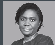
Funke Okubadejo Real Estate, Nigeria