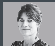
Sarah Douglas Communications, London London