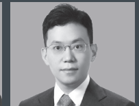
Julian Kim Real Estate, Seoul