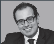
Bruno Moraes Energy Infrastructure, Brazil