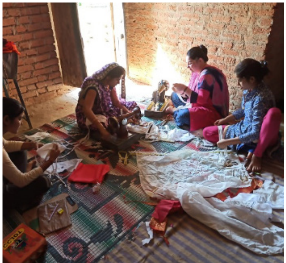
Masks manufactured by Self Help Group