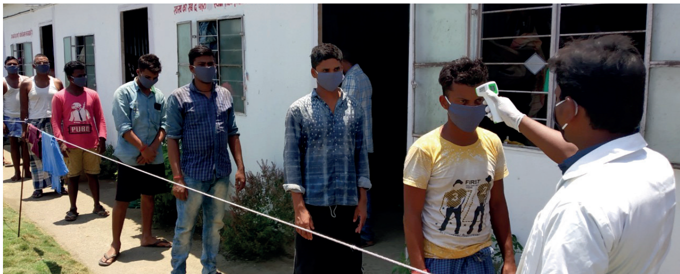
Temperature testing on site