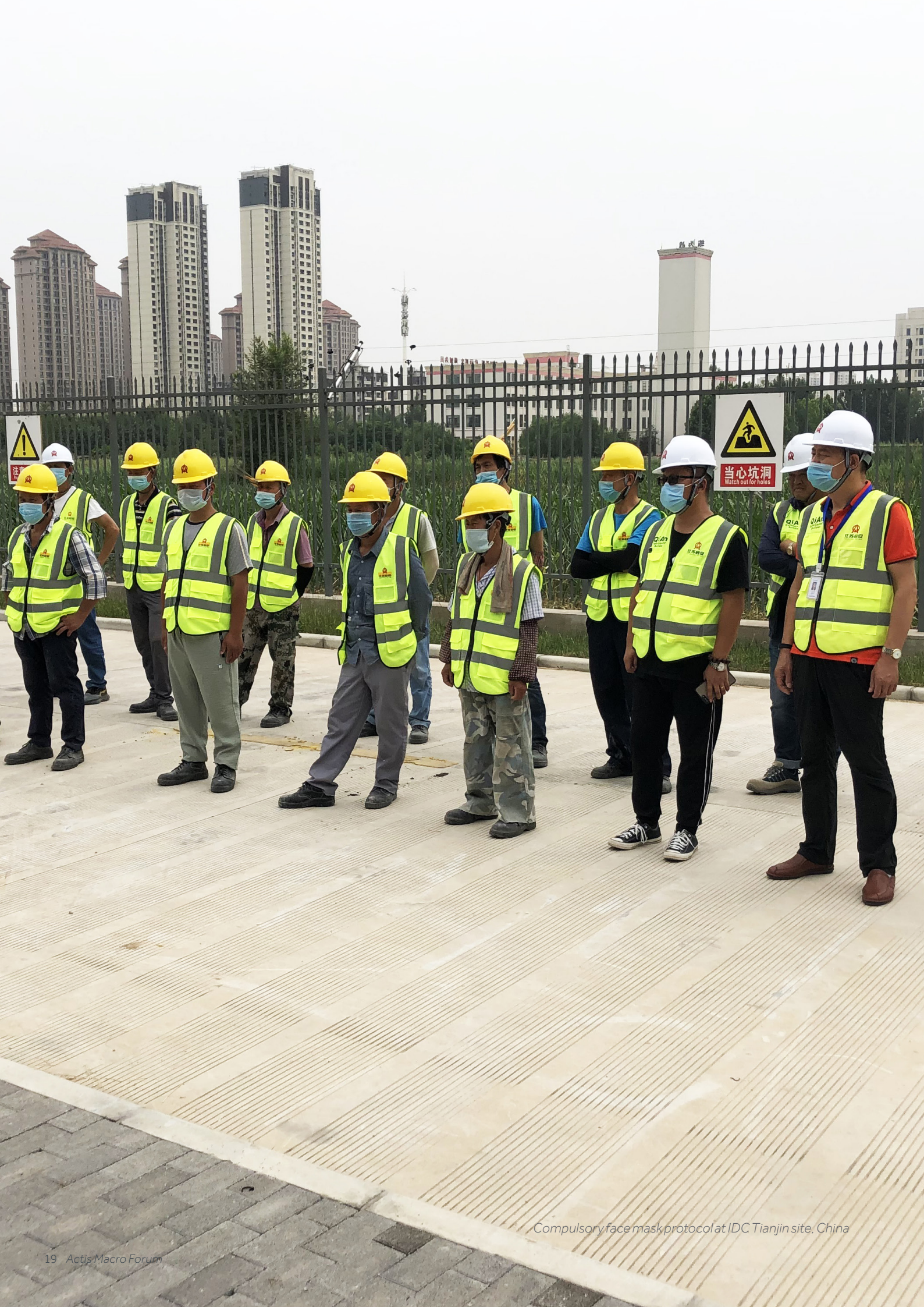
Compulsory face mask protocol at IDC Tianjin site, China