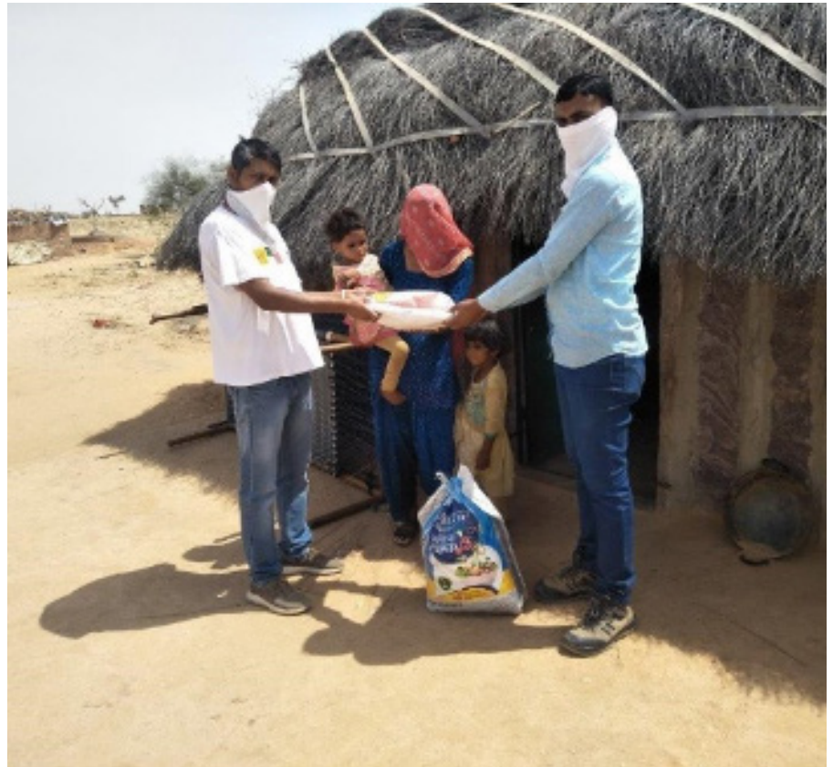
Food packet distribution

The Actis Energy team has been incredibly supportive throughout this period. They have provided a range of support from creating opportunities for direct exchange of experiences including learnings and challenges faced through interactive sessions between Sprng and other energy platforms; sharing valuable insights, lessons and guidance to our COVID-19 related planning and SOPs for our office and project sites.