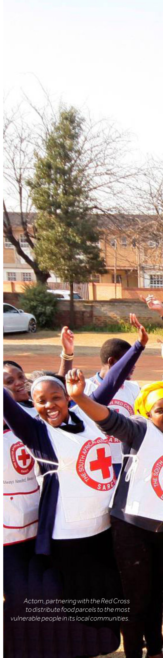
Actom, partnering with the Red Cross to distribute food parcels to the most vulnerable people in its local communities.

Our strong ties and communication channels with local stakeholders have enabled us to mobilise support swiftly, to target areas of greatest need such as food, PPE, medical equipment, cleaning products and to reach the most vulnerable. Our companies are working with local authorities to ensure efforts are coordinated and not duplicative. Most of our companies have re-oriented their social investment plans to tackle COVID-19.