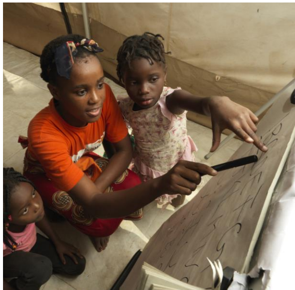
SAFE & LEARNING SPACES