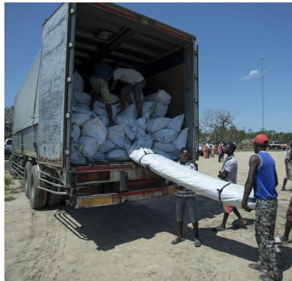
SHELTER & NFI