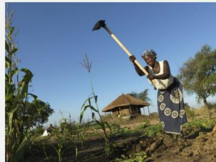
Luisa uses the tools she received at a distribution run by a DEC member