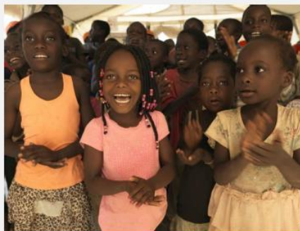
Children attend a child friendly space funded by DEC.

DEC-funded activities will continue until March 2021.