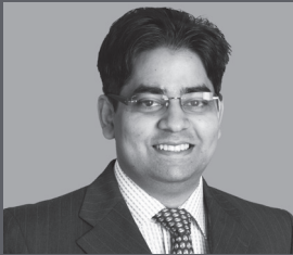
Pratik Jain Financial Services, India